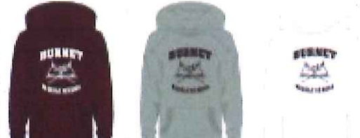
HOODED SWEATSHIRT (SCREENPRINTED LOGO)