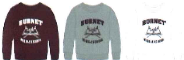
CREW NECK SWEATSHIRT (SCREENPRINTED LOGO)