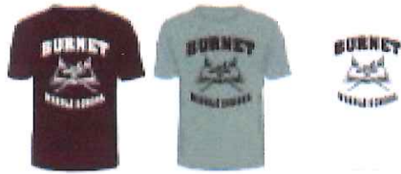
SHORT SLEEVE T-SHIRT (SCREENPRINTED LOGO)