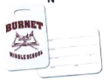
LUGGAGE TAG/ NAME TAG