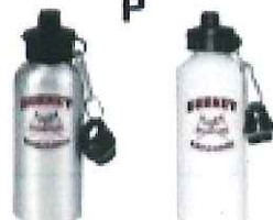
WATER BOTTLE SILVER OR WHITE STAINLESS STEEL