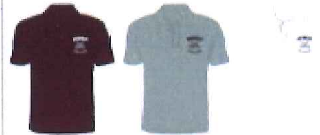
POLO SHIRT (SCREENPRINTED LOGO)