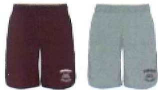
MESH SHORTS (SCREENPRINTED LOGO)