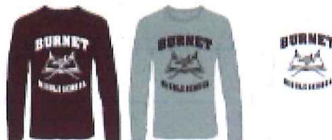
LONG SLEEVE T-SHIRT (SCREENPRINTED LOGO)