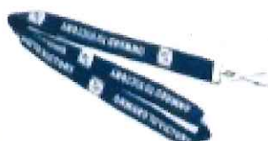
1/2" LANYARD W/ SCHOOL NAME