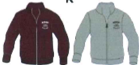
FULL ZIP HOODED SWEATSHIRT (SCREENPRINTED LOGO)