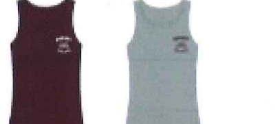
LADIES FLOWY RACERBACK TANK TOP (SCREENPRINTED LOGO)