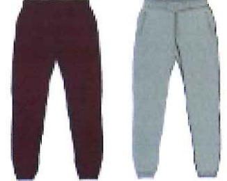
SWEAT PANTS W/ ELASTIC (SCREENPRINTED LOGO)