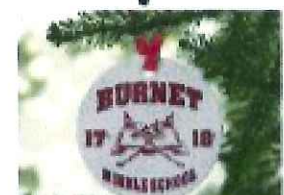
CHRISTMAS ORNAMENT W/ DATE 1718