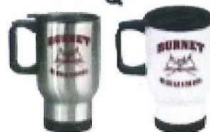
TRAVEL MUG SILVER OR WHITE STAINLESS STEEL