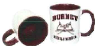
11OZ CERAMIC COFFEE MUG WITH MAROON INTERIOR