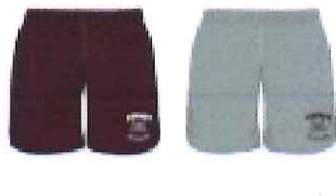
LADIES MINI MESH SHORTS (SCREENPRINTED LOGO)