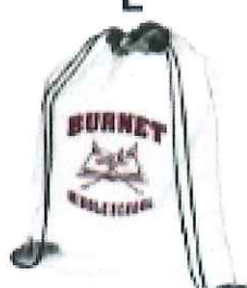
TRANSPARENT DRAWSTRING BAG