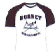
3/4 RAGLAN (SCREENPRINTED LOGO)