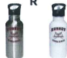
WATER BOTTLE W/ STRAW SILVER OR WHITE STAINLESS STEEL